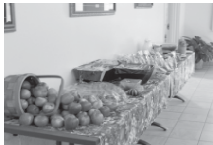
Freeland Chamber Business After Hours 2005