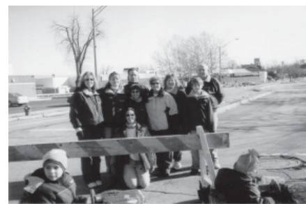
Annual PRIDE Christmas Parade 2005